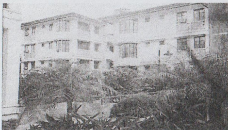
SERVING THE UNIVERSITY SINCE 1993.

Right beside Ikeda Hall is the Kapit-balay (Neighbor) where we offer fully-furnished studio and apartment units for guests of the University to make it their "home away from home", primarily to foreign visiting professors, scientists, artists, researchers and many more.