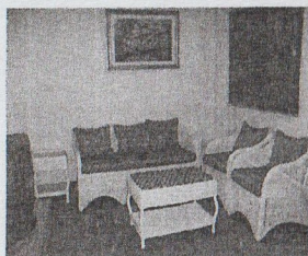
FAMILY SUITE LOUNGE AREA

The Kapit-balay (neighbor) provides housing facilities for visiting professors, scholars, researchers and foreign graduate students, and