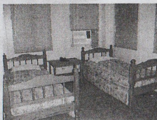
BIG STUDIO UNIT

Conveniently located in the heart of the University of the Philippines campus in Diliman, Quezon City, U.P. Balay is only a few meters away from the University Health Service, the Catholic and Protestant churches, the University Shopping Center and the UP Co-operative Store, where one can find almost everything from food, clothing apparels, toiletries to internet shops. Most academic buildings are within walking distance. For public transport, our location is accessible to all routes going around and out of the campus.